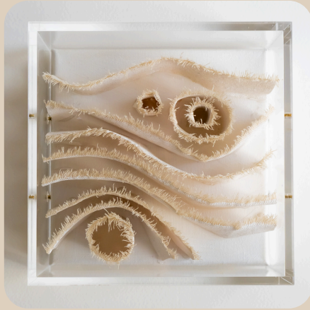
6 x 6

You're considering purchasing a torn ribbon from my Torn series. Most likely you're curious what the pricing is for one of these pieces. The prices below are an example of what to expect for the cost based on the size. Message me at stef@stefshock.com to discuss the size you want even if it isn't mentioned below. Pricing for framing on the next page. Shipping and handling not included.