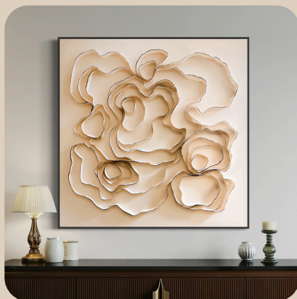
40 x 40