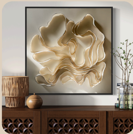
36 x 36